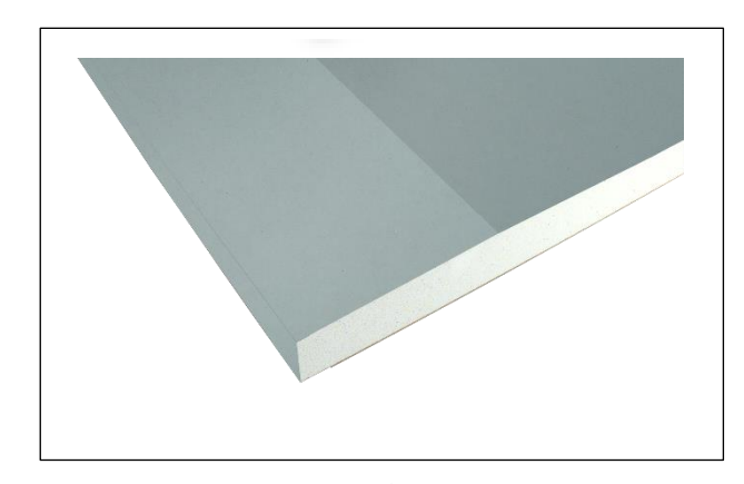
Manufacturer address: Bålsta plant at Kalmarleden 50, 746 24 Bålsta, Sweden