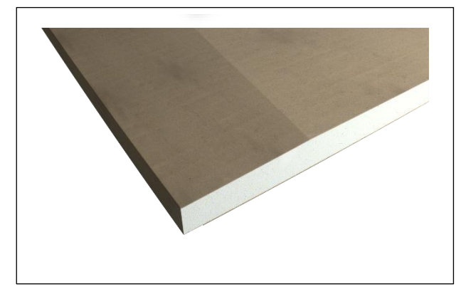
Manufacturer address: Bålsta plant at Kalmarleden 50, 746 24 Bålsta, Sweden